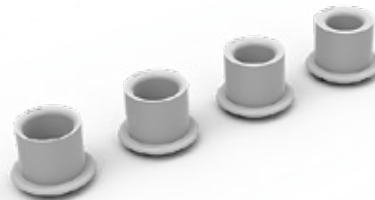
MEDIKRO® Calibration Syringe Outlet Port Adapters