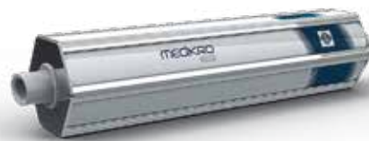
MEDIKRO® Calibration Syringe