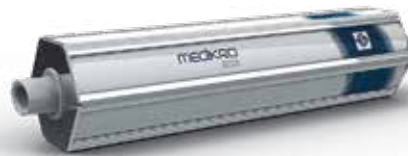
MEDIKRO® Calibration Syringe